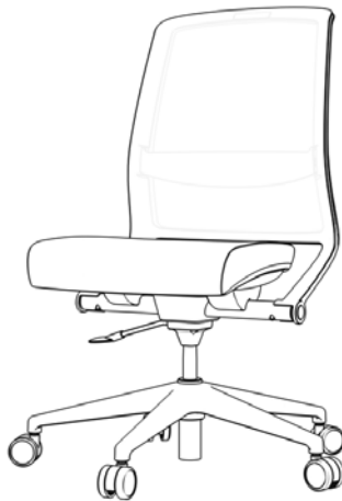
Mesh Back Armless